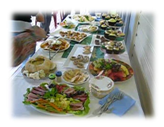
Thank you to staff for providing such a delicious spread for our community special morning tea.