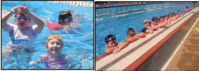
Swim School Program 2011