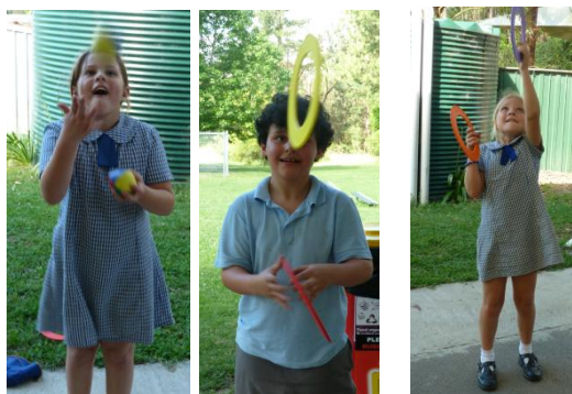
After School Sport students participated in Circus Skills activities during Term 4

Term 4 - Week 8 - Friday 2 December 2011