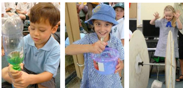
Small School Science Day activities