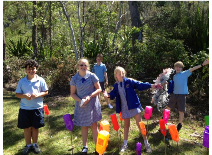
Students from 4/5M used recycled waste items to produce artwork for the Coles/Landcare 'Wastebuster' Grant.