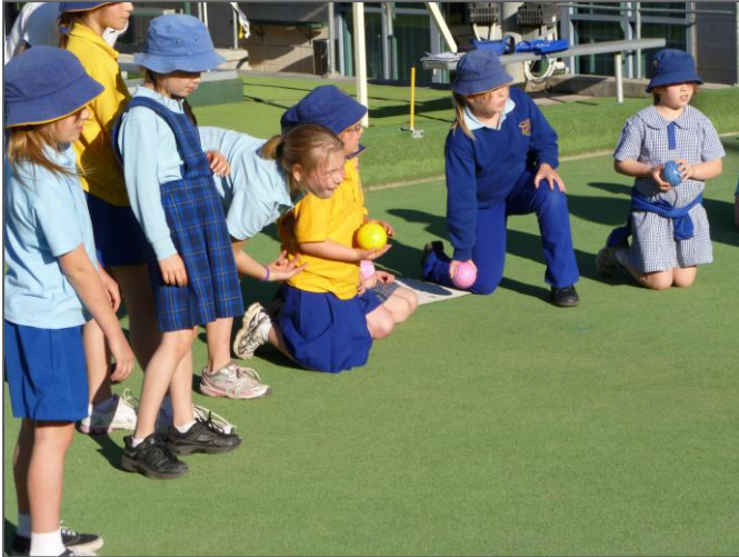
Our After School Sport students travelled to Gosford City Bowls Club for a 'taster game' of Lawns Bowls.

This week our Year 3 & 4 students will experience the wonders of the Blue Mountains on their two day excursion along with students from Peats Ridge, Somersby and Spencer Public Schools. Highlights of the trip will include Elizabeth Farm, Echo Point, the Scenic Railway and Cableway, Jenolan Caves and the Hartley Historical Village. We hope the all students and teachers have a wonderful time.